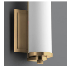
-40 Aged Brass