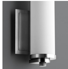
-20 Polished Nickel